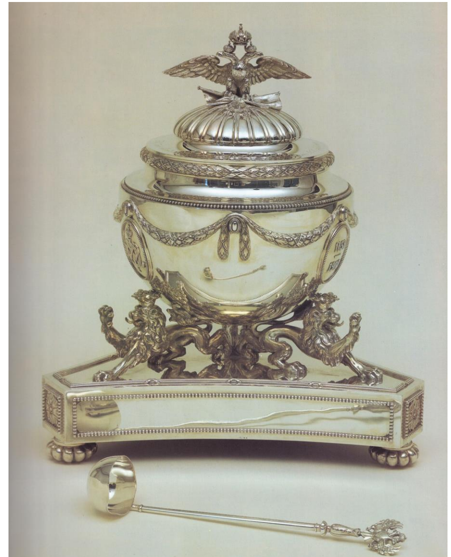
Monumental Bowl of the Royal Danish life guard, 1908

In 1900 one of the biggest sensations in the world was the international fair and the Trans-Siberian Railway, Faberge house created the most complex of the imperial eggs Trans-Siberian Railway Egg in order to mark the beginning of the construction.