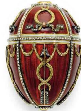
Яйцо «Бутон розы» The Rosebud Egg

The Imperial Rosebud Egg was created for the Empress Alexandra Fedorovna in 1895.