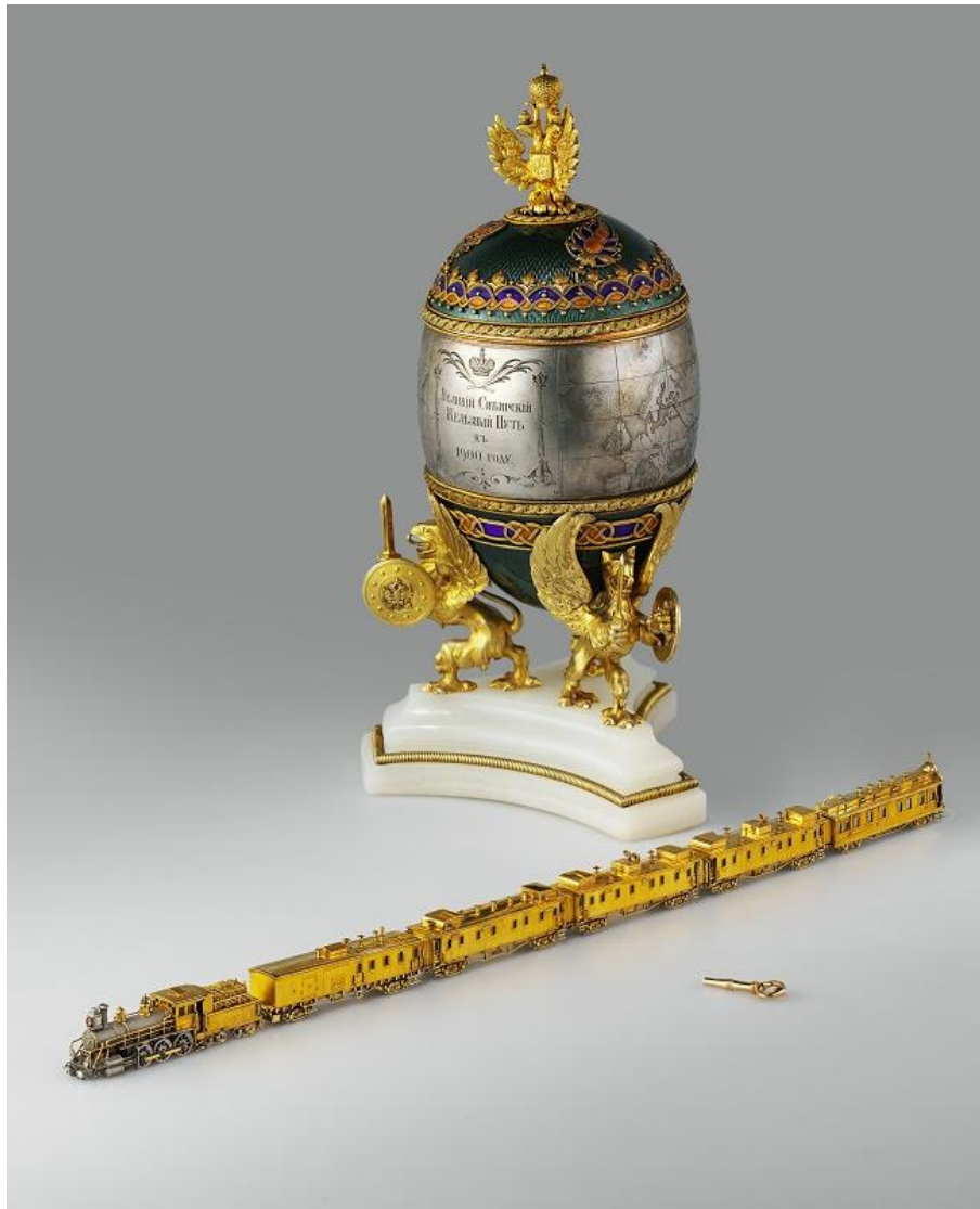
Trans-Siberian Railway Egg

In 1900 one of the biggest sensations in the world was the international fair and the Trans-Siberian Railway, Faberge house created the most complex of the imperial eggs Trans-Siberian Railway Egg in order to mark the beginning of the construction.