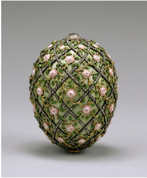
The spectacular Imperial Rose Trellis Egg , originally created in 1907, celebrated the birth of Czarevich Alexei, son and heir of Nicholas and Alexandra.