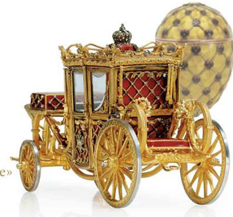
Яйцо «Коронационное» The Coronation Egg

Given by Czar Nicholas II to Empress Alexandra Fedorovna in 1897 on the first Easter following their Coronation, the Coronation Egg is a masterpiece of craftsmanship.